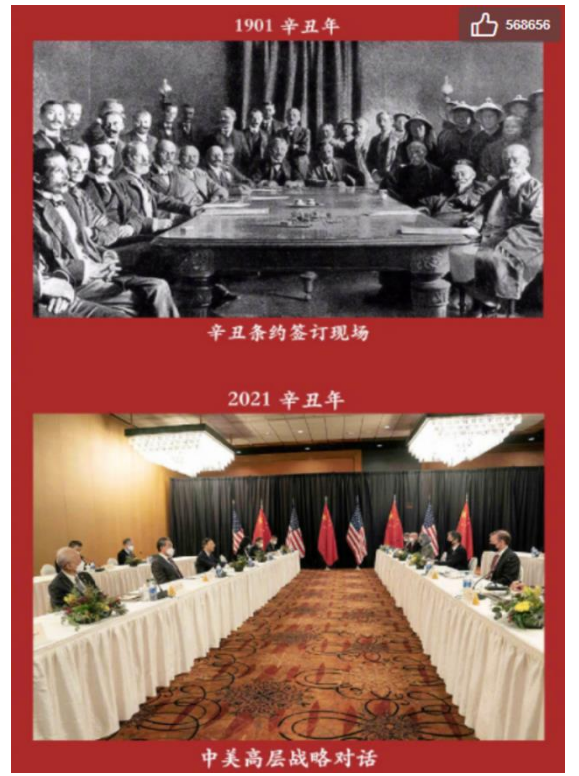
Figure 1: (Top) 1901, Signing of the Boxer Protocol (Bottom) 2021, United States–China strategy talks in Alaska

war, also known as the Boxer War, eight nations shared the goal of crushing the violent anti-Christian and anti-foreign grassroot uprising in China. What motivated this project was the discovery that while the eight foreign powers' invasion is an indispensable part of Chinese nationalism and has long remained a significant cultural and political notion in China well into the twenty-first century, the very concept of a coordinated alliance does not exist on a comparable level of importance and historical magnitude on the side of the allies.<sup>2</sup>