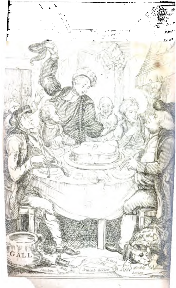
Lemono! Lemonous do by Google