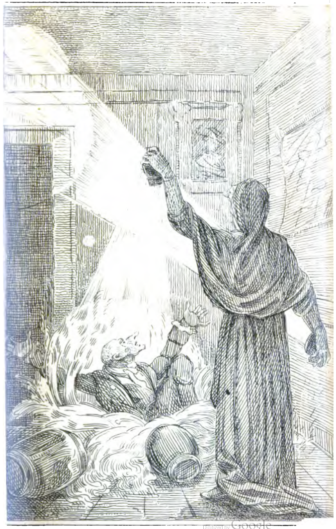
Two Lighte upon one Subies