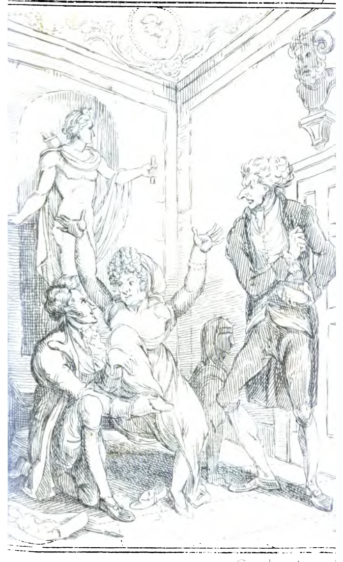
Digitized by Google