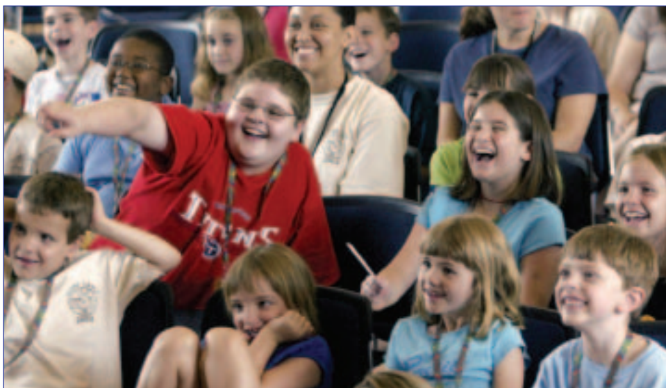
Fun at TRIAD summer camp

offers district-wide in-service training workshops for school personnel.