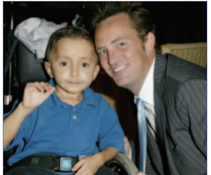
Emmy-nominated actor Matthew Perry hosted the Benefit.