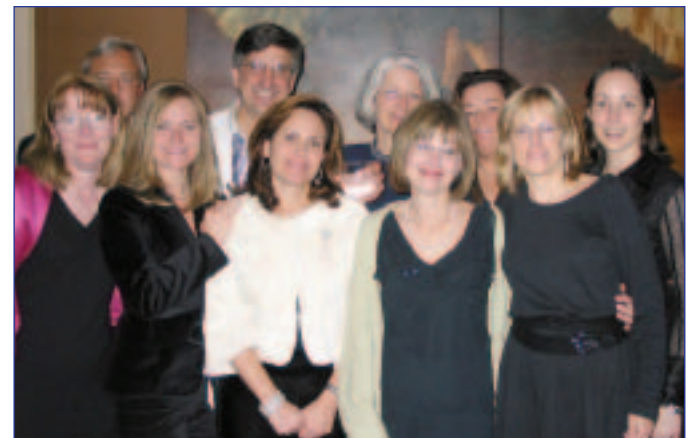
Our Vanderbilt Kennedy Center "stars"