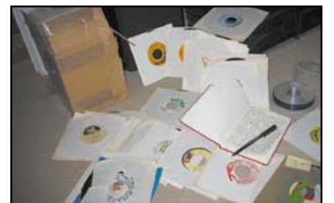
Archive project inception, cracking open the first 45's...