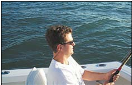
Me catching tarpon on a Vandy boys reunion weekend.