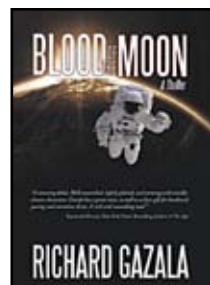
Blood of the Moon, A Thriller -- Front Cover