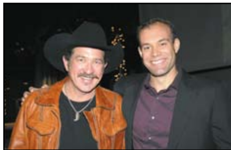
Me with Kix Brooks at a fundraiser in Nashville.