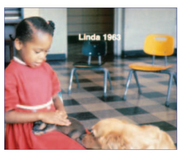
The Early Training Project helped prepare preschoolers for school learning.

Dr. Gray was excited at the thought that these children could be educated in a regular classroom. We visited the different centers and observed, for example, mothers who were tossing a ball to their children and those who were getting their children to walk in a straight line. The motor activities each