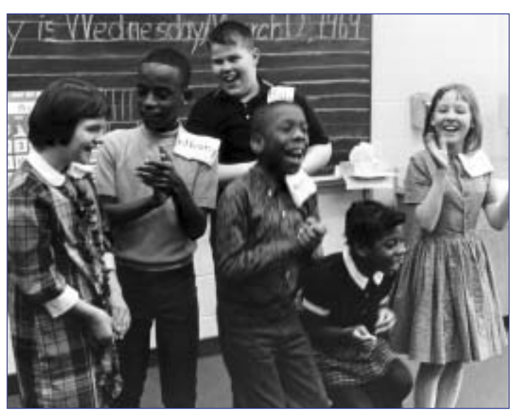
Kennedy Center researchers collaborated with Metro Nashville Public School educators to develop new instructional strategies for students with intellectual disabilities.

Education of diverse learners. In the 1960s and 1970s, researchers in the Institute for School Learning and Individual Differences and later in the Institute on Teaching and Learning investigated concept development and teaching strategies in reading, math, geography, and physical education, for students with and without disabilities. In the 1980s,