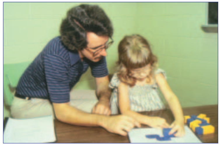
Dynamic Assessment has been used since the 1960s to evaluate children's potential to do new learning and to generalize that learning.

When Peabody merged with Vanderbilt in 1979, the Center was able to expand its biological and biomedical research and include many more disciplines. The breadth and depth of research was enhanced further in 2001 when the Center became a university-wide research, training, diagnosis, and treatment institute, embracing faculty and resources in Medicine, Nursing, Arts and Science,