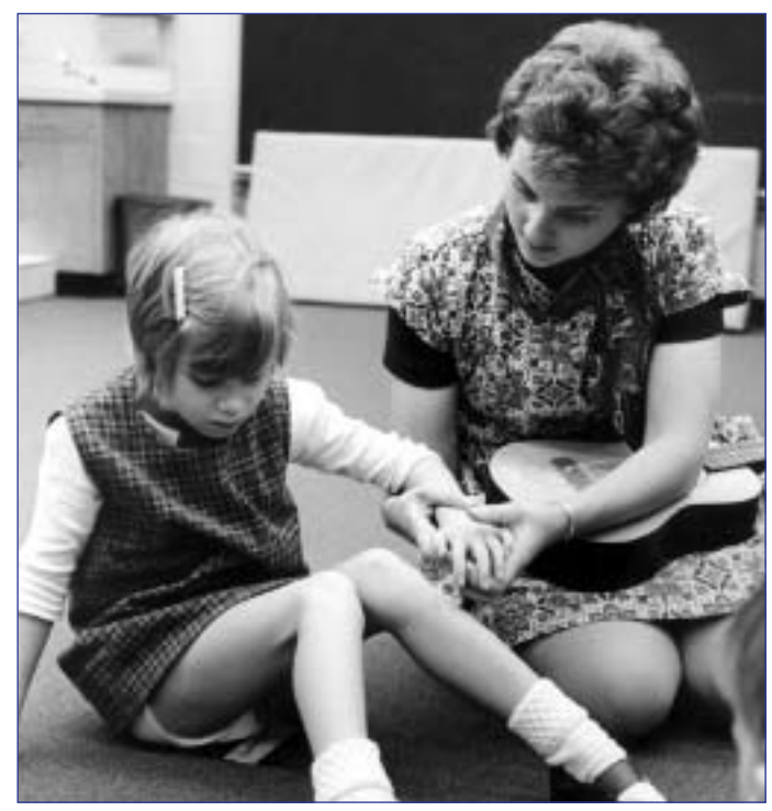
In 1969, an Experimental School model classroom served children with multiple sensory and cognitive disabilities, developing curricula, training teachers, and supporting parents.

The Susan Gray School provides inclusive education for young children with and without disabilities and support for their families. Its fourfold mission is providing high-quality service, supporting research, contributing to the training of future teachers and researchers, and demonstrating recommended practices as a national model. It is a program of the Vanderbilt Kennedy Center and Peabody College.