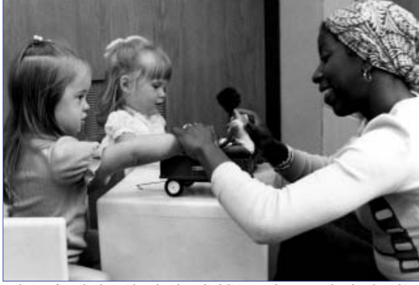
Inclusion of preschoolers with and without disabilities was demonstrated and evaluated in the Experimental School in the early 1970s.

A third example is yet another illustration of how