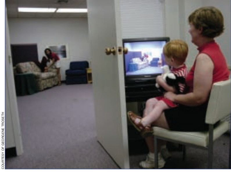
Researchers used a closed-circuit video system to create an interactive video learning situation, which was contrasted with toddlers learning directly from the same adult.

Compared to the "finding game" used in the