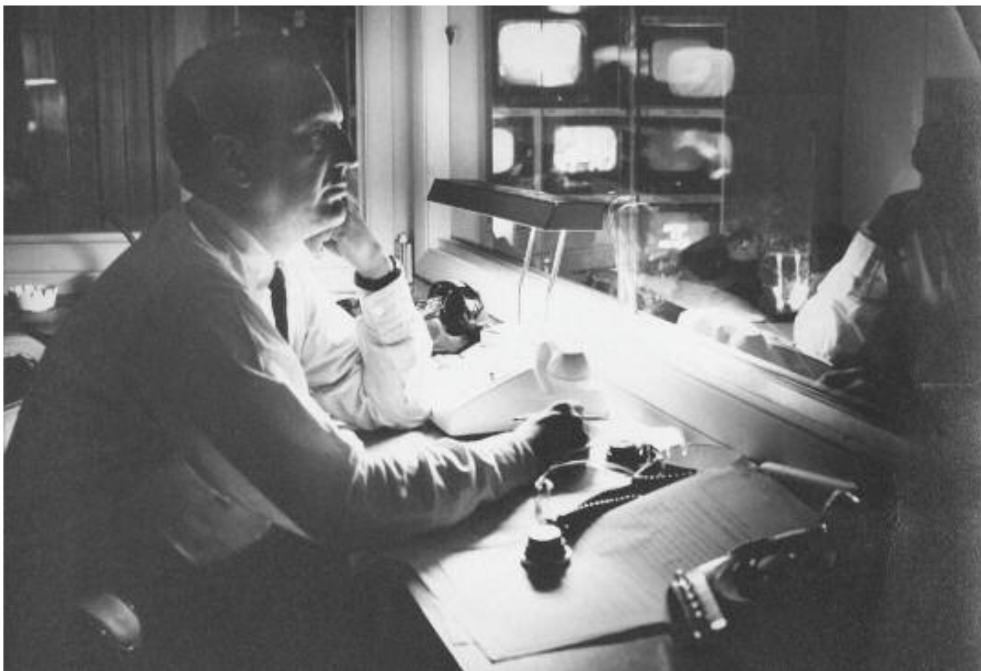
The nearly four decades of Julian Goodman’s NBC career, from 1945 to 1979, reads like a course in modern American history. On the cover, Goodman gets ready for convention coverage with Herbert Schlosser, and is shown with former Presidents Ford, Johnson and Nixon.

“There are more opportunities to be inaccurate now. But there are plenty of people to correct you. Your competition will correct you.” —Julian Goodman