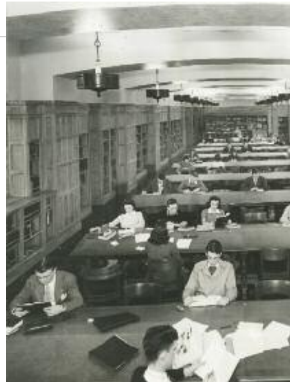
The Central Library in 1941 featured all the newest offerings—fluorescent lights, air conditioning, vacuum tubes and book conveyor belts.