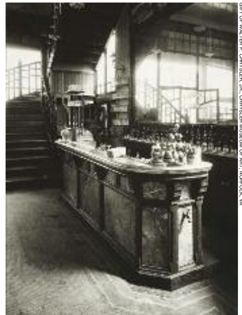
Eugène Atget. The wine seller 15 Rue Boyer, 1910-1911. Gelatin silver print.