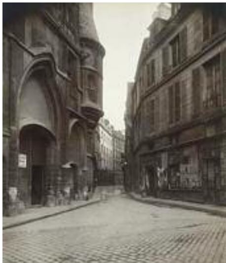
Eugène Atget. Rue du Figuier, 1924. Albumen print, 9 in. x 7 in.

Twilight Visions: Surrealism, Photography, and Paris , an exhibition that premiered at the Frist Center for the Visual Arts in Nashville, included books loaned from the Pascal Pia collection in the W.T. Bandy Center for Baudelaire and Modern