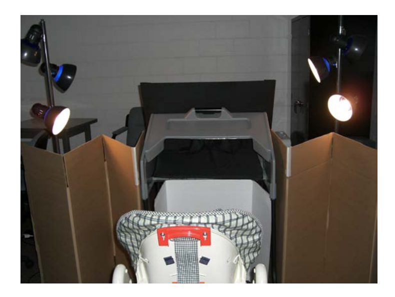
Figure 1. Apparatus

The stimuli included both an experimenter (social stimulus) and a toy (non-social stimulus). Throughout the course of this study 5 different individuals served as examiners, 4 females and 1 male. The toy was held by another experimenter, but the face and body of the experimenter were hidden by the apparatus so that only the toy was visible to the infant. The toy presented was