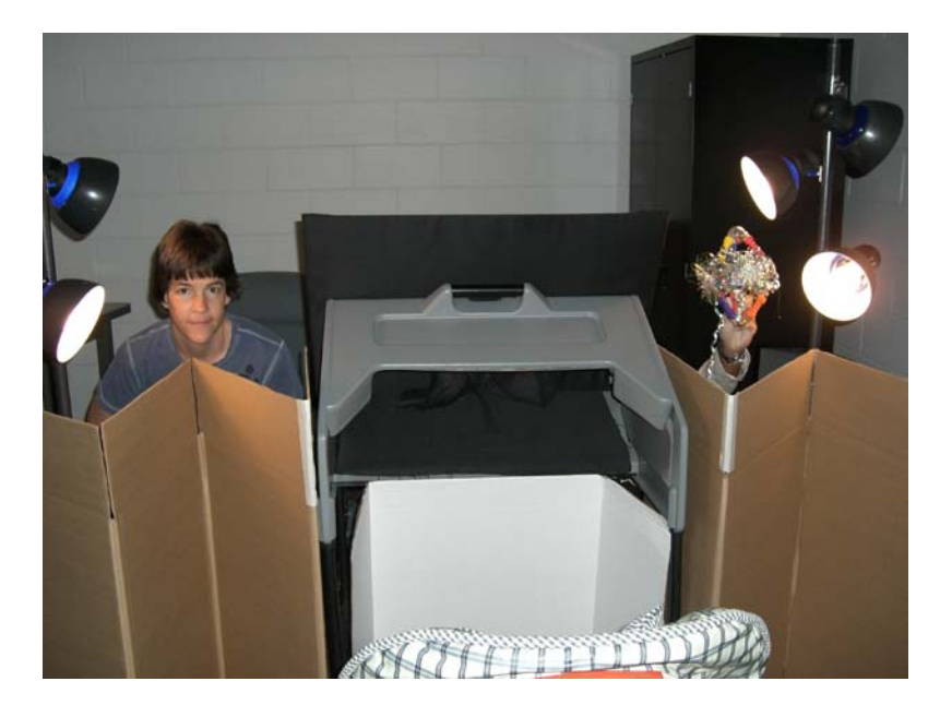
Figure 2. Apparatus and stimuli

Two cameras were set up to record the experiment. The first camera monitored the baby's face. The second camera monitored the experimenters, zoomed out enough to display the entire partition and the stimuli that appear on either side.