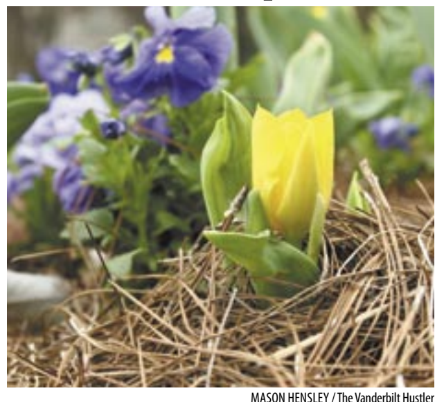
Today is the first day of spring. The high temperatures for this week are predicted to be in the 70s, encouraging flowers to bloom all over campus.