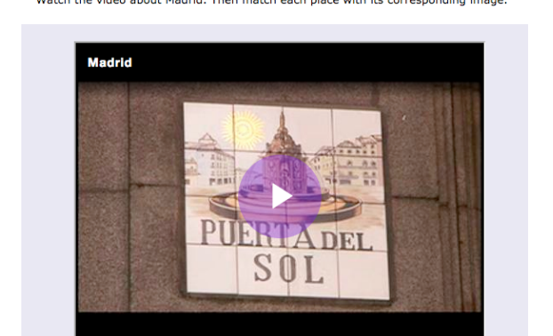
Figure 5. Figure 6.

Celebraciones La Feria de Abril es un famoso festival de Sevilla, España. Hay paseos de caballosº,