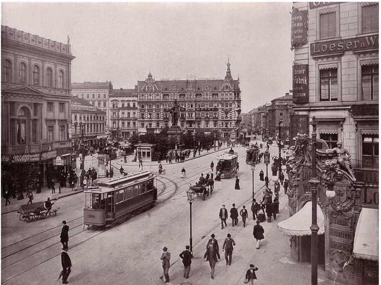
Figure 1 - Berlin Alexanderplatz 1903

The reading of newspapers in the streets cars creates another layer to be read in regards to forward motion. On the one hand city dwellers are in a vehicle that was invented for transportation from one point to another in a timely fashion thereby meeting the daily demands of a modern society, while the newspapers were written to keep citizens updated on events occurring in the metropolis. Keeping all its residents abreast on the news would allow them to be at the forefront of any kind of change thus thrusting