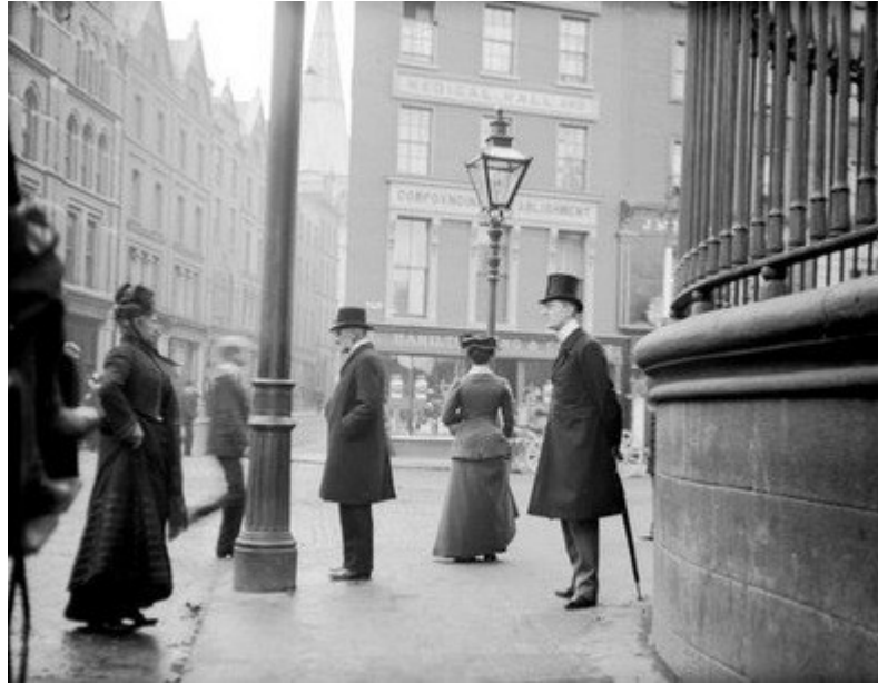
Figure 3 – “Historical evidence of The Flâneur? Or just man waiting for his wife?” –