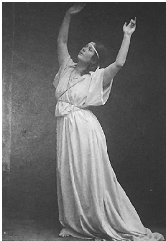
Figure 7 – Isadora Duncan, by Elvira Studio, 1903

Duncan’s work was not always met with approval as controversial questions arose as to if she were really dancing. Just as Fuller was also questioned along the same lines, Duncan seemed to incur more scrutiny as it appeared that she was merely posing and not