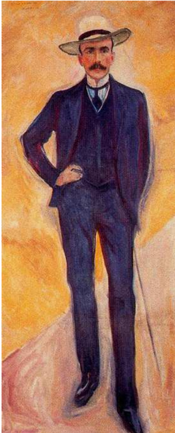
Figure 4 – Harry Graf Kessler by Edvard Munch, 1907

(Figure 4) 146 Along with his dapper appearance, he had the impeccable manners of a