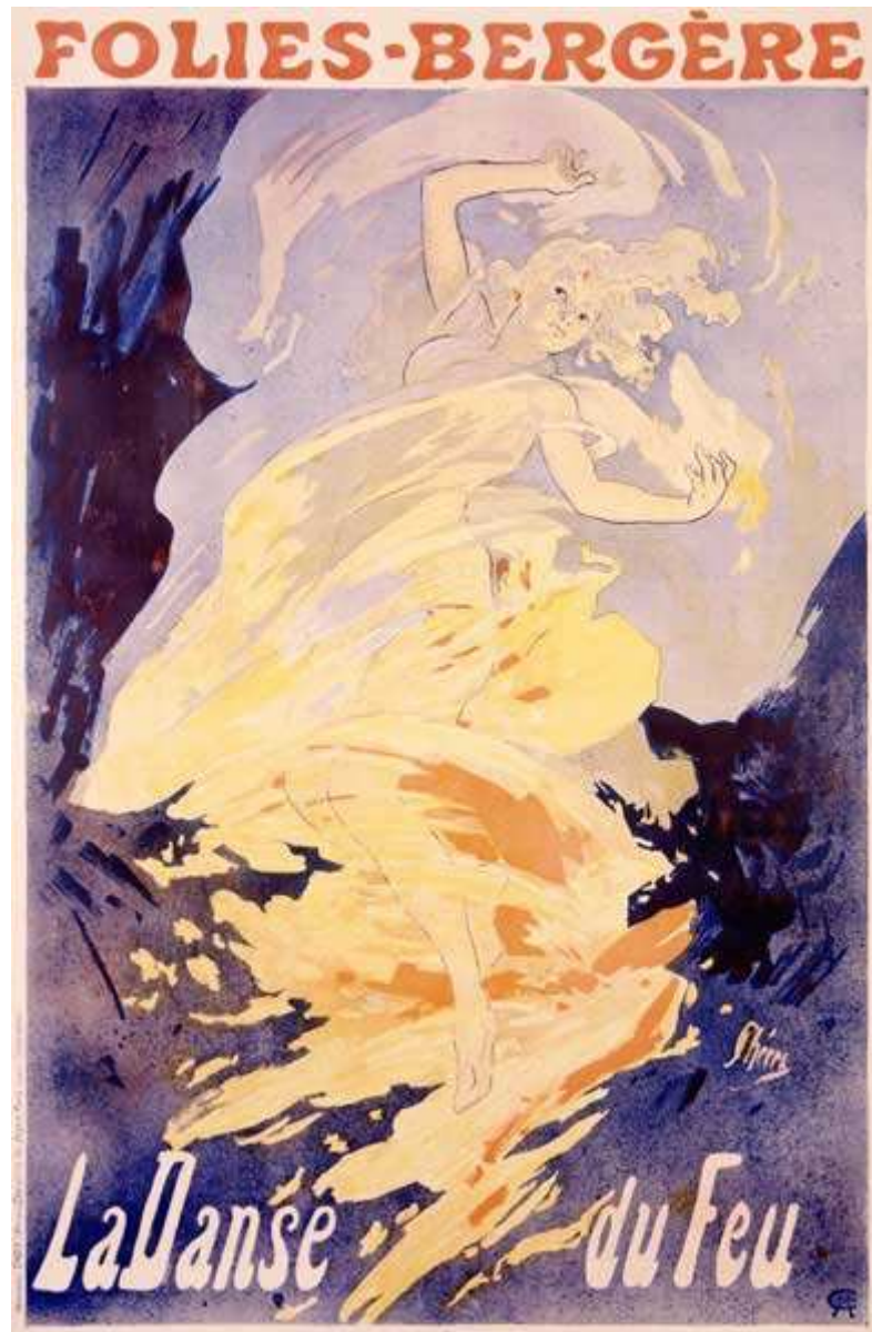
Figure 6 - Danse de feu , by Jules Chéret, 1897

streets in Berlin, as the poster strongly invokes images of movement. As the flowing depiction of the dancer on the poster coupled with the bowing and curving of the Littfassäule thematically compliment the Jugendstil form of the buildings, their overall impression creates a massive urban space in perpetual motion. Although the posters by Chéret were to advertise Fuller's performances in Paris, Theodor Heine created his own