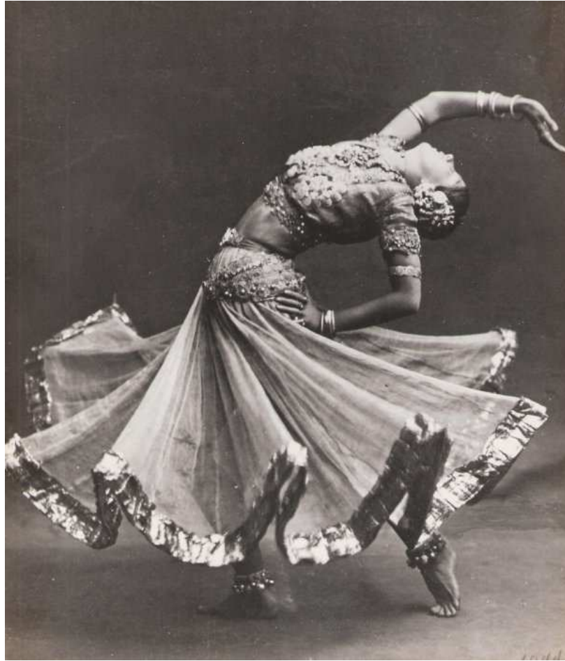
Figure 8 – Ruth St. Denis in Radha , 1906

In stark similarity to Brandstetter's description of Loïe Fuller's Serpent Dance , St Denis' performance also had qualities of being degendered yet still retaining some femininity. Fuller's performance can be recognized as a woman dancing, but her long, draping costume draws more attention to the materiality and abstraction of the dance and less to her gender. St. Denis also has a similar effect on Kessler as she wears a dress which appears to become an extension of her skin. The blurring line between body and costume also blend a contrast between erotic femininity and a genderless, sensual abstraction.