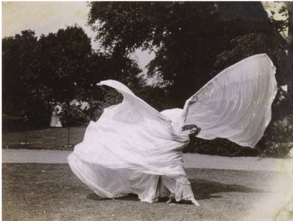
Figure 5 – Loie Fuller Dancing, ca. 1900

The American-born Fuller began her musical and theatrical training in Vaudeville: a US venue comparable to the European Varietés, in which a number of unrelated acts were performed. Her success there may have helped her obtain contracts for the Berlin and Paris Varietés. Her most memorable Serpent Dance involved a large