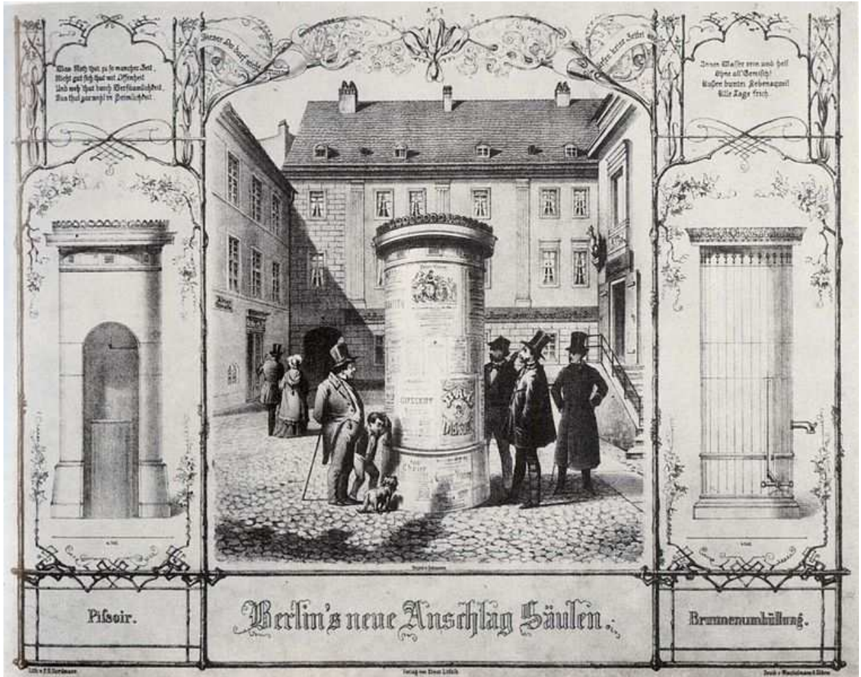
Figure 2 – The first Litfasssäule in the courtyard of Litfass’ printing shop, Adlerstraße.

They began looking like giant exclamation points 69 and they “screamed,” their “thick