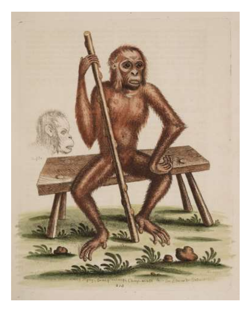
Figure 15. George Edwards, "Man of the Woods"

Bartholomew Fair – the Parrot and Cage – but from a pub on the strand whose proprietor dealt in such imports.<sup>89</sup> Edwards saw the "Man of the Woods," taxidermized, at the British Museum, where, after its death, its preservers "set [it] up in the action [he had] given it."<sup>90</sup>