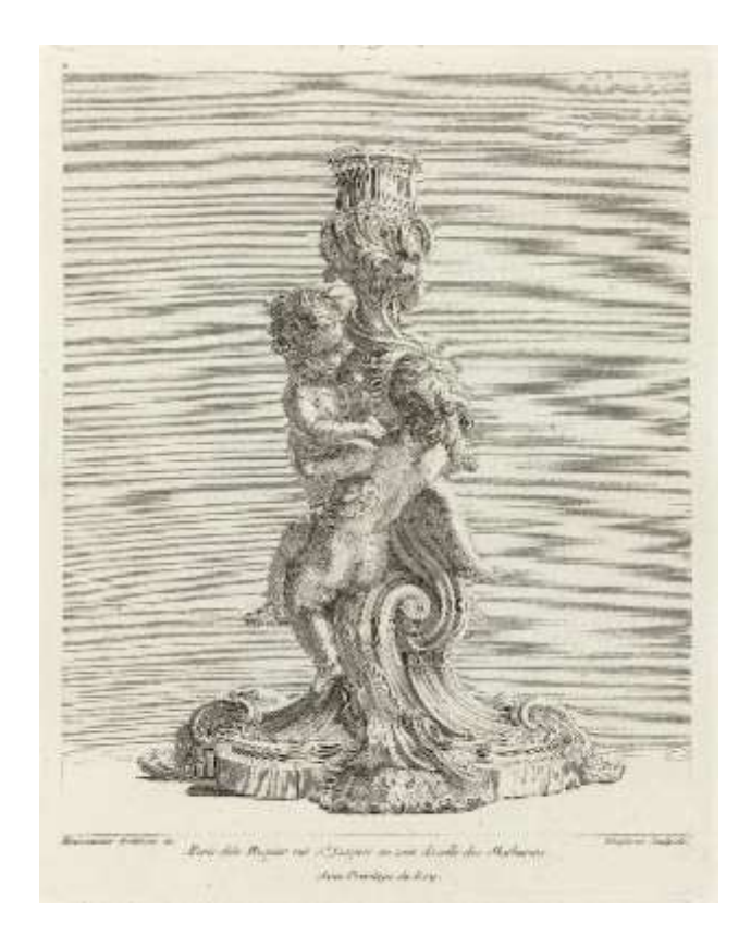
Figure 3. Louis Desplaces after Juste-Aurèle Meissonnier, Candlestick (1728)

away. Its generative potential is exemplified by Juste-Aurèle Meissonnier's 1728 candlestick, which required three engravings by Louis Desplaces to represent it in two dimensions. In a manner related to Hogarthian looking, the Rococo calls the embodied eye into existence, as a physically specific entity attached to a human frame. Meissonnier was lambasted for refusing to let a railing or a balcony behave straightforwardly, preferring that they not only squirm but sublimate into flowers and scrolls.<sup>27</sup> He was accused, by Charles-Nicholas Cochin, of having assassinated the straight line.<sup>28</sup>