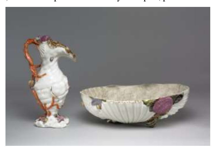
Figure 8. Capodimonte Porcelain Factory, Ewer and Basin

Some critics witness, at the opening of the eighteenth century, a decline in taste for the strangenesses that motivated the baroque.<sup>94</sup> However, the rococo reminds us that if the monstrous had gone out of main stream fashion, the playful could yield bizarre results. Through this ewer and basin, circa 1750, from the Capodimonte factory in Naples, porcelain enables the influx of the