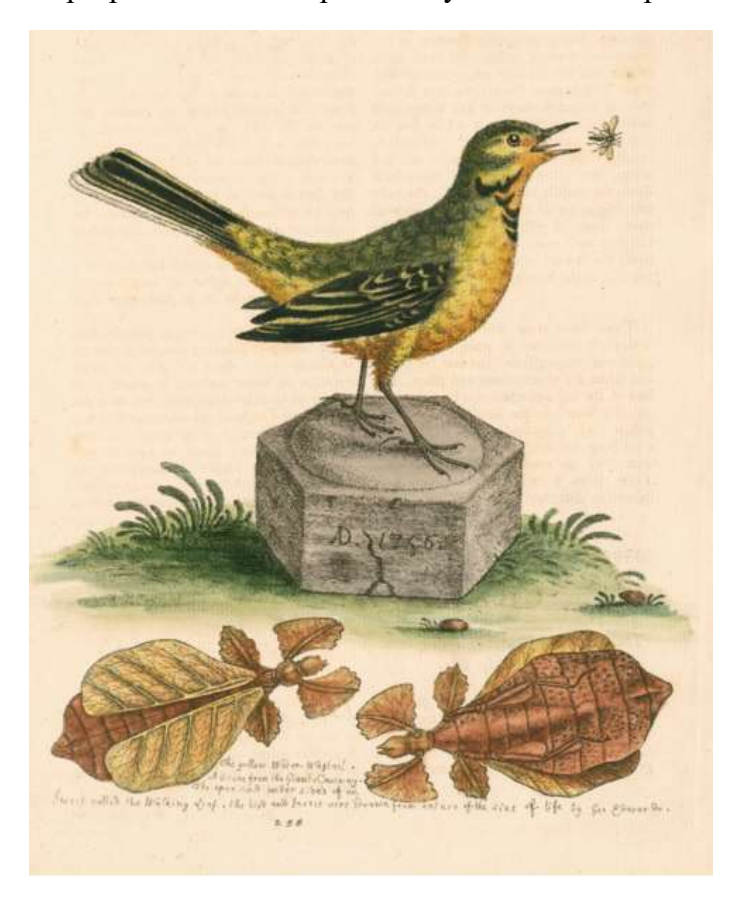
Figure 16. George Edwards, "The Yellow Water-wagtail, the Walking Leaf, &c" from their "savage" ancestors, and would revert to "first forms and colours" were they reacquainted with "their native habitations." <sup>99</sup> However, to view Edwards's illustrations with said convictions in mind is to observe a complicated tension at work in the relations between aesthetics and fealty to nature.

"appointed climate" and installed in another would either fail to reproduce or bring forth young lacking the correct "first properties." This explains why domesticated plants and animals differ