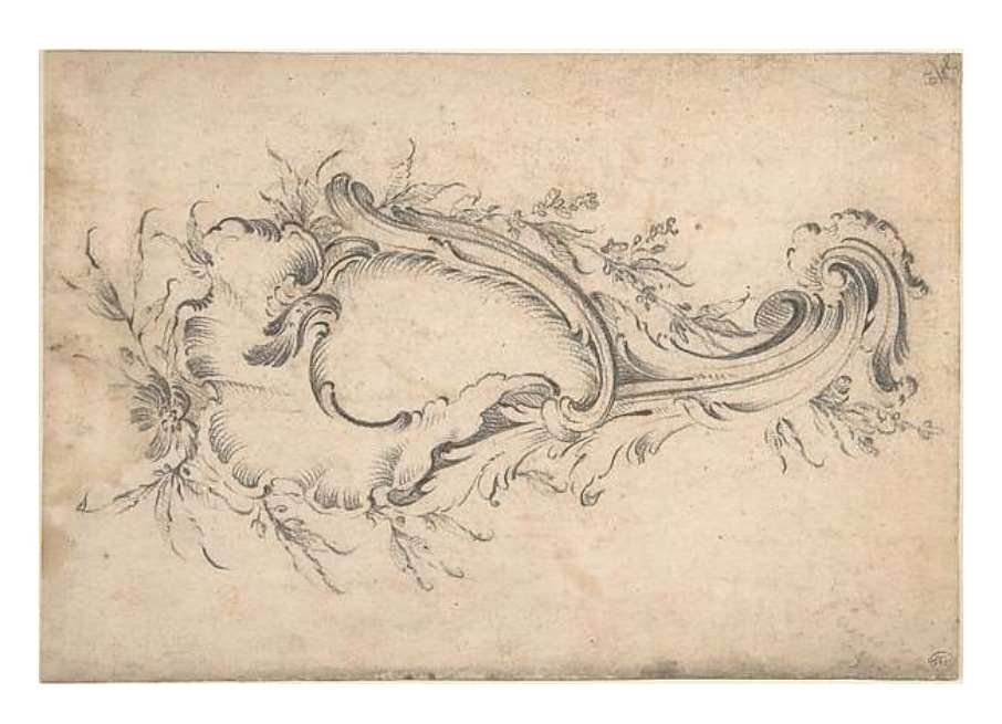
Figure 4. Rococo cartouche (Anonymous, French, 18th c.)

It is a fascinating irony that rococo decorative style, indigenous to the ménages of the