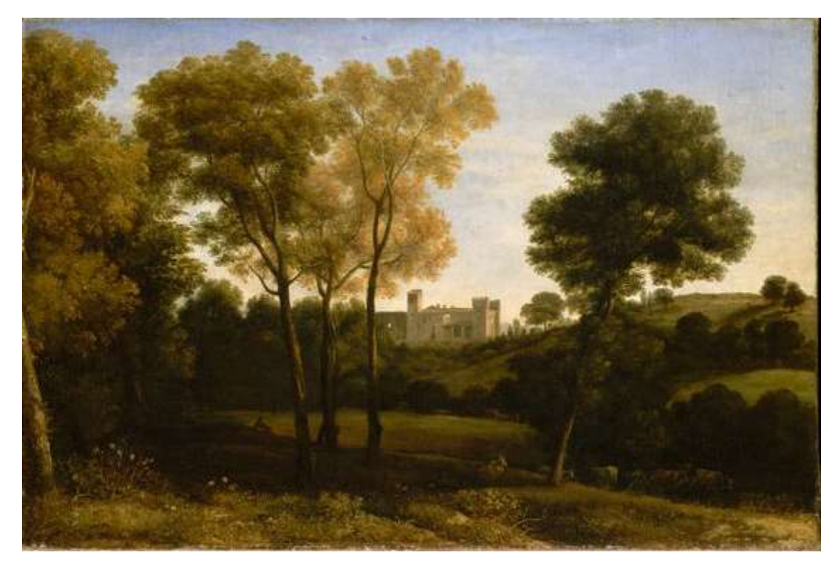
Figure 13. Claude, View of La Crescenza (1648-50)