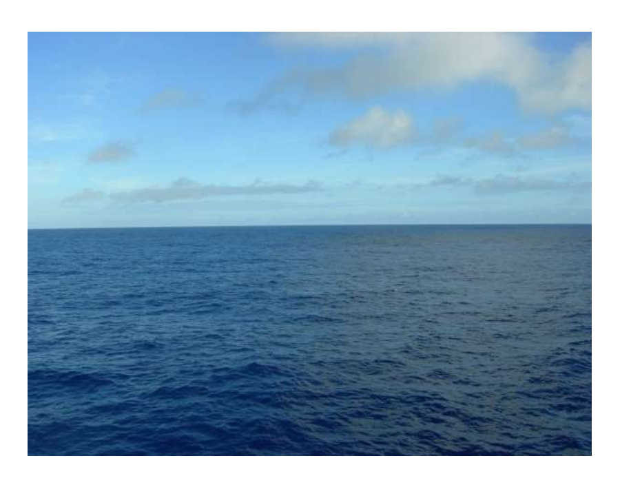
Figure 20. Miriam Goldstein, "The real Great Pacific Garbage Patch"

This photograph, "of" the North Pacific Subtropical Gyre, is uncannily beautiful, but does not appear to conform to William Gilpin's picturesque principles. All the same, it can be interpreted in terms of a shaky inversion of the picturesque's relationship to spectacle. Where Gilpinian process employs spectacularity before discarding it, the photo cries out for its reader to imagine a spectacular island of waste, breaking the serene waves. Or does it? It is, as much, a call for the kind of re-vision<sup>103</sup> Nixon propounds, a training of perception to think and look past , to unfamiliar and unspectacular times, stories, and processes. Whichever interpretation one adopts, spectacle is present, an unsteady, uneasy, and undeniably fruitful fulcrum for natural vision.