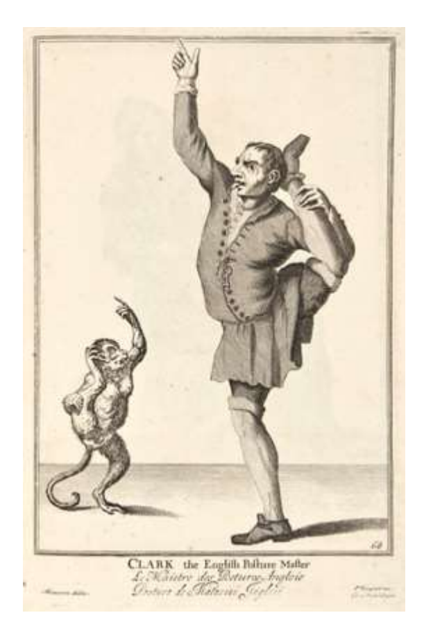
Figure 14. Marcellus Laroon, Clark the English Posture Master

If the distinction between humans and other sorts of animals had to do with degrees of mechanical complexity, then spectacles could suggest uncanny kinships.<sup>25</sup> In any case, machines and models were not the only actors displaying challenging and exciting instances of weird mobility.