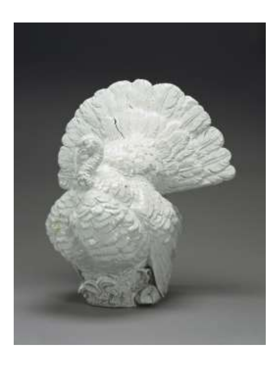
Figure 11. Johann Joachim Kändler, A Turkey (c. 1733)

other creatures, many of which Augustus commissioned as part of a scheme for a life-size porcelain menagerie. After formal likeness would come natural coloration, one of several steps that proved ultimately unfeasible. But the questions raised by Kändler's turkey and its commedia dell'arte relations remain pertinent: what does the confluence of porcelain performativity and artful animality indicate about the links between performance and the idea of Nature?