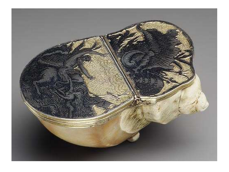
Figure 7. Table snuffbox (ca. 1745-50)

Through the Rococo, the ocean draws spectators away from faith in a monolithic visual mode for seeing the world truly. It is given to odd doubling effects, as in this Russian snuffbox,