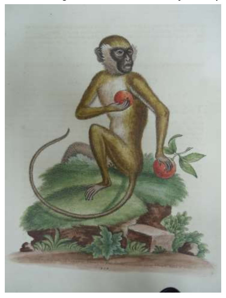
Figure 17. George Edwards, "St. Jago Monkey"

a "St. Jago Monkey," after the island of Santiago, in the Cape Verde archipelago, where these Old World primates had been introduced. Since arriving in England, he claims, she has given birth, and her "very tender" treatment of her infant is remarkably humanoid: "her actions and manner nearly resembled a woman's nursing her child." She delivers a powerfully sympathetic