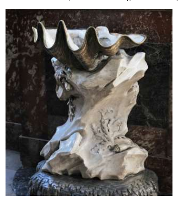
Figure 5. Jean-Baptiste Pigalle, Bénitier (1745)

Were one forced to select one single motif as most exemplarily symbolic of the rococo, one would likely choose a shell. Antonio Bossi's stuccowork in the Weisser Saal (White Hall), at the Würzburg Residence on the river Main, achieve the reorganization of space's coordinates