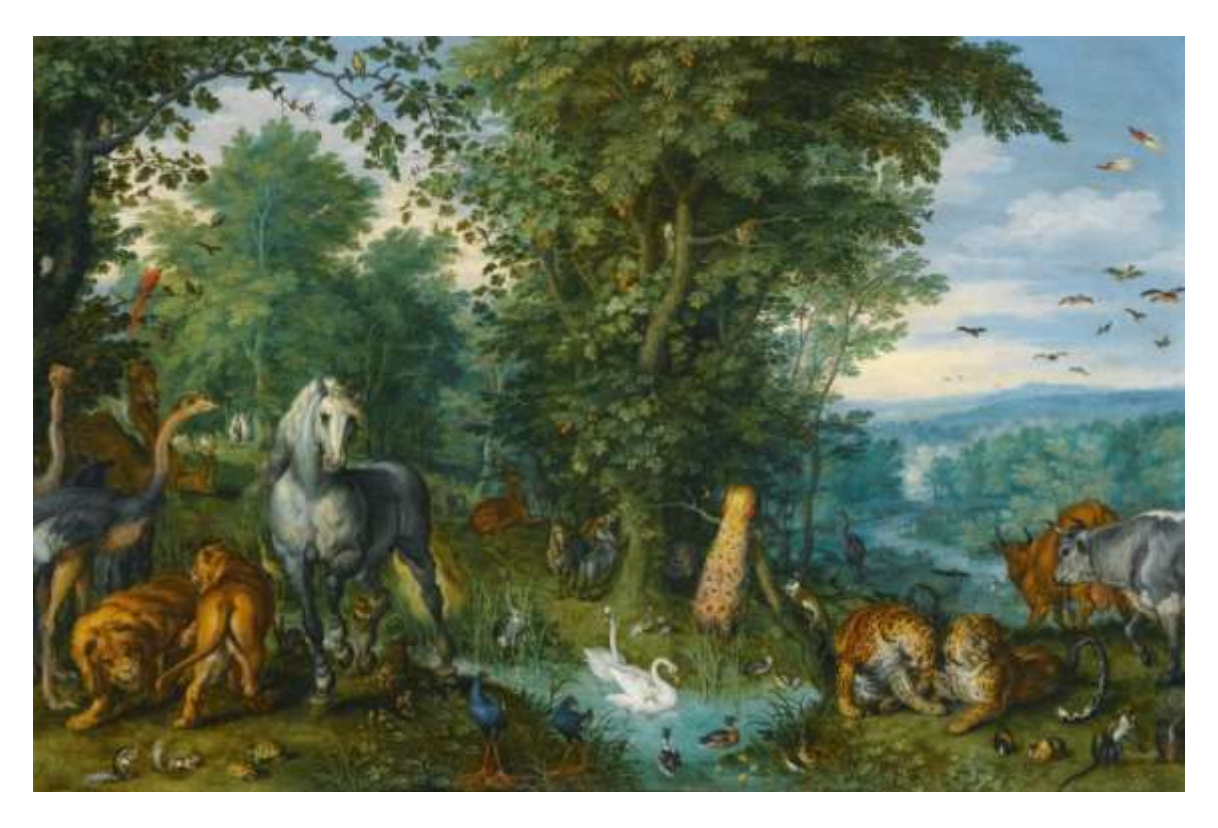
Figure 12. Brueghel the Elder, The Garden of Eden with the Fall of Man (1613)