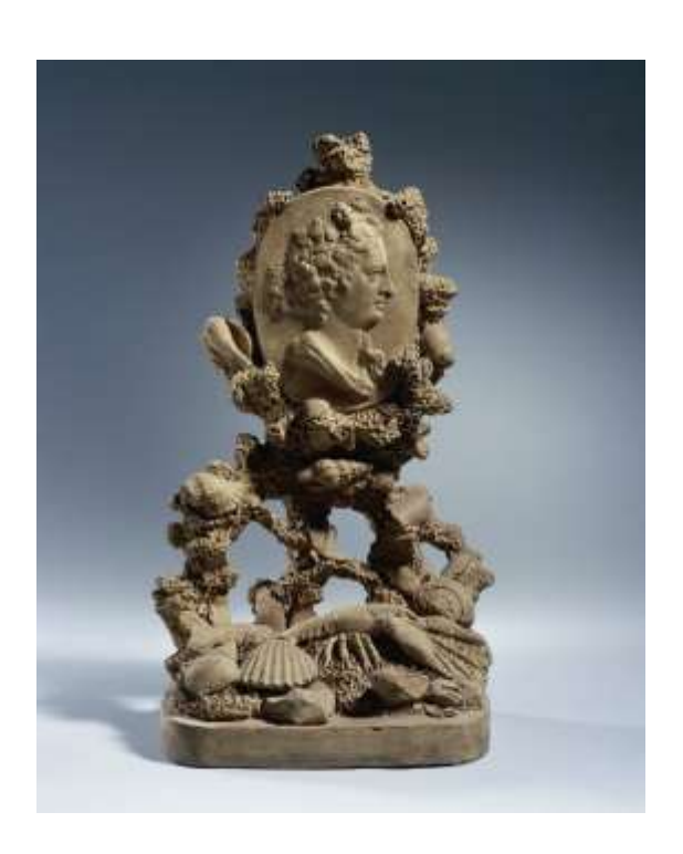
Figure 6. Jean-Baptiste Janelle (le Jeune), Medaillonportret van een vrouw (1741)

The Rococo is powerfully, simultaneously invested in fantasy and in careful attention to natural form. A 1741 terracotta medallion and stand by Jean-Baptiste Janelle the younger seems to exemplify this tendency. Cast "directly from nature," the coralliform support attracts by far the