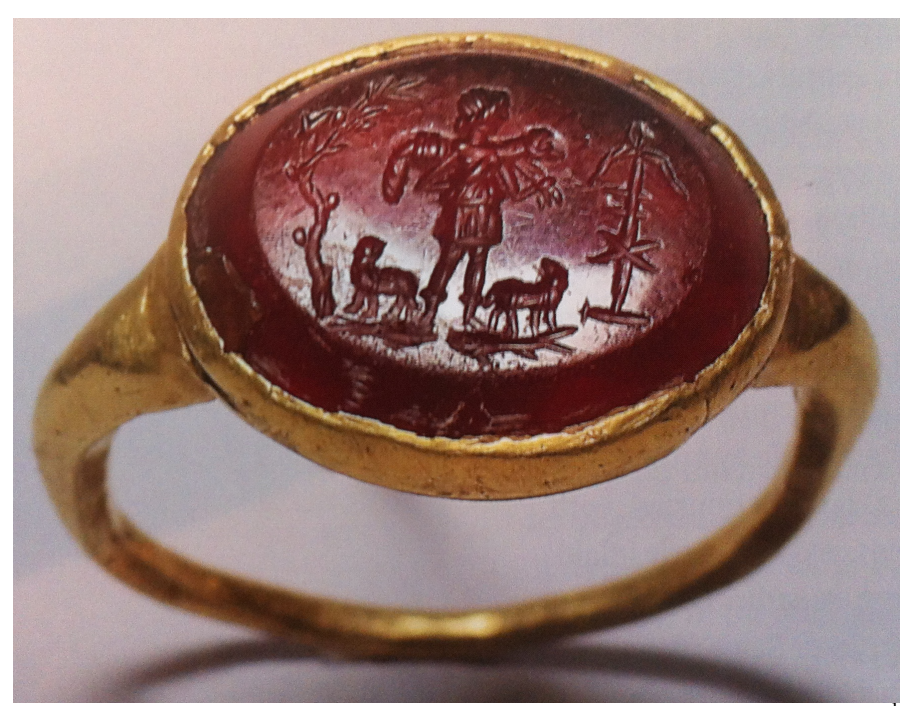
Figure 3. Engraved Gem with the Good Shepherd, in a Ring. Late 3<sup>rd</sup> Century. ( Picturing the Bible , 193)