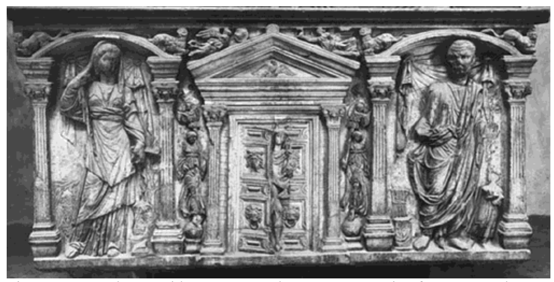
Figure 6. Sarcophagus with Hermes Psychopompos emerging from a central doorway, c. 200-50 CE. ( Facing the Gods , 346)