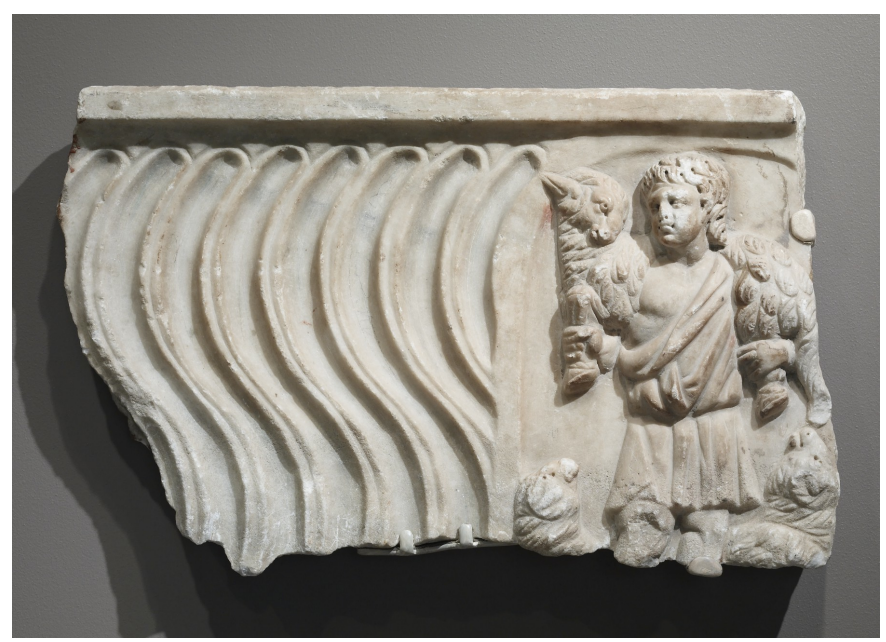
Figure 2. Good Shepherd from a small Early Christian sarcophagus that was probably made for a child. (Walters Art Museum)