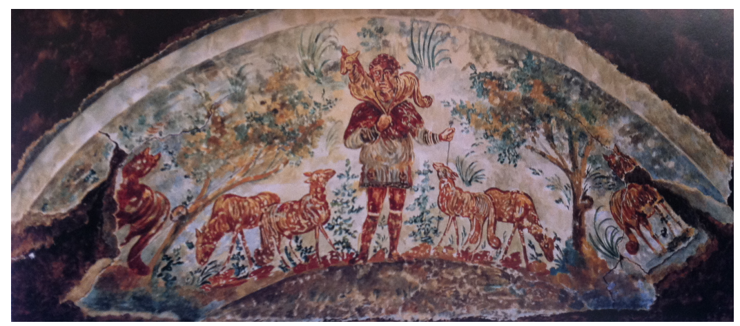
Figure 1. Catacomb of Domitilla: Fresco with the Good Shepherd. ( Picturing the Bible , 189)