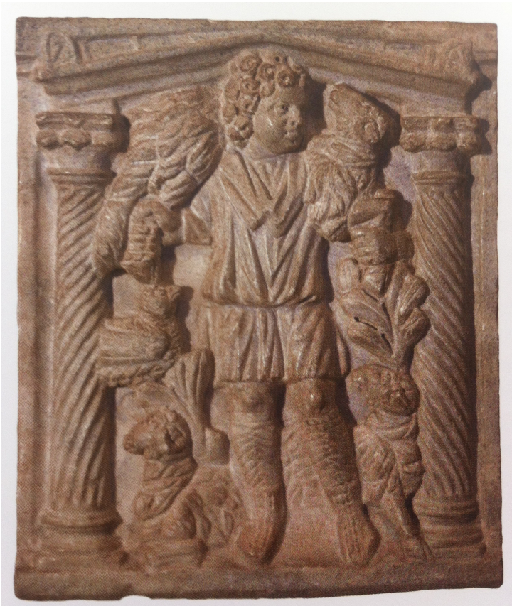
Figure 4. Table support ( trapezorhoron ) in the Form of a Youthful Ram Carrier (Kriophoros). Mid-4<sup>th</sup> century. ( Transition to Christianity , 151)