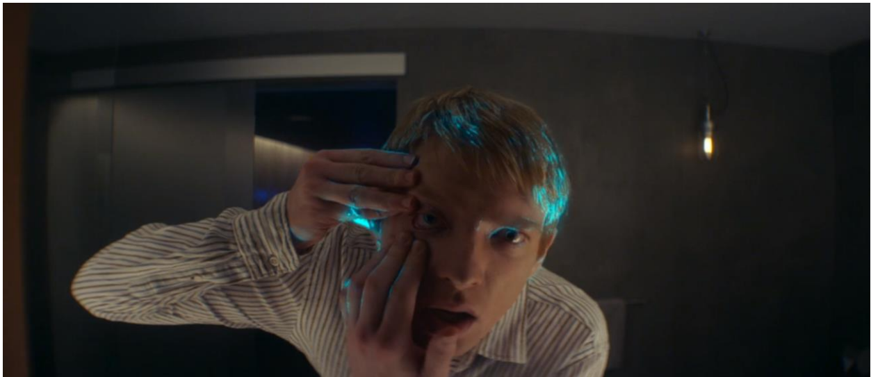
Figure 3. the ambiguity of viewer perspective

wholly ambiguous (figure 3). Are we seeing a default feature of the mirror itself, or are Caleb's fears valid in the sense that he is, in fact, an artificial object unaware of his own existence? Or rather, should we interpret the light beams as coming from the perspective of the viewer, so that it is ultimately our own screen/eyes that have acquired such unnatural qualities? To complicate matters further, the scene—now showing Caleb's bloody, cracked mirror—directly cuts to a pensive Kyoko staring intensely at her own monitor, indicating that she has been anticipating and surveilling Caleb's reactions since their earlier exchange. Have we been experiencing the scene vicariously through the synthetic eyes of Kyoko, then? It is clear that the film plays with the viewer's self-perceived distance from its characters; just as Caleb is made to question his personhood in the face of Kyoko's startling artificiality, the cinematic choices in this scene leads us to question exactly whose body we are occupying behind the screen-mirror. In this sense, the film further broadens its portrayal of Ornamentalism at work in redefining subjectivity not only for its characters, but also the viewer.