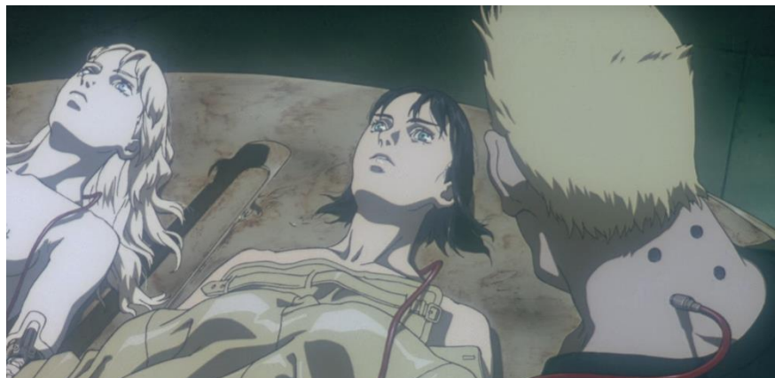
Figure 9. Kusanagi and the Puppet Master's merging