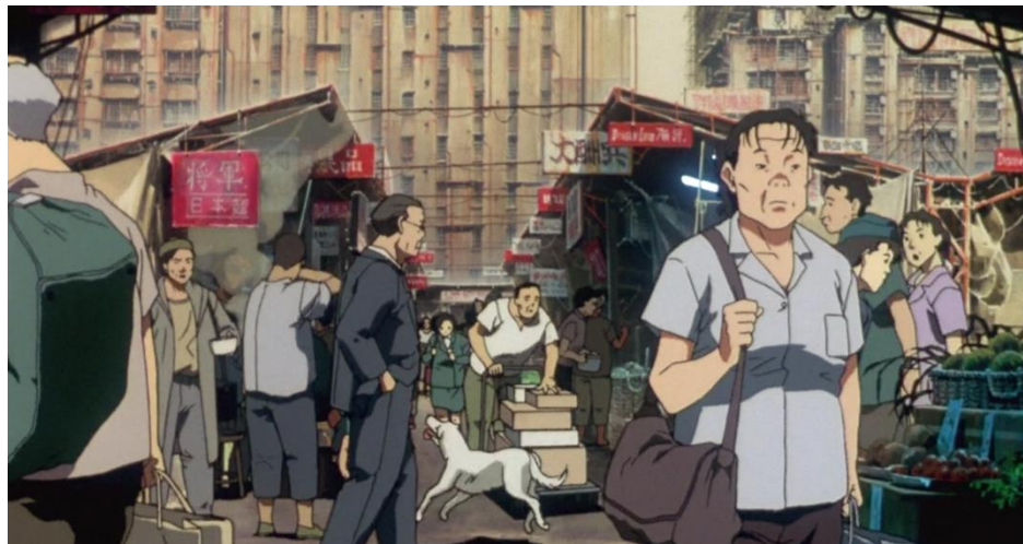
Figure 6. Hong Kongers in the city background

Nevertheless, despite this intra-Asian Othering, the film also offers powerful vectors of reconfiguration for the Asian woman's embodiment and personhood in ways that are at the very least intriguing if not radically subversive. This ambiguity in the film's treatment of race and objecthood shares affinities with Homi Bhabha's influential theorization of colonial mimicry, wherein the relationship between the colonizer and colonized is one that is marked by ambivalent mimesis; the colonizer, while desiring a reformed Other that recognizes and adheres to the same hegemonic ideologies to which they are subject, nevertheless calls for a kind of imitation that ultimately renders the two "almost the same but not quite" (Bhabha 126). For a total, perfect