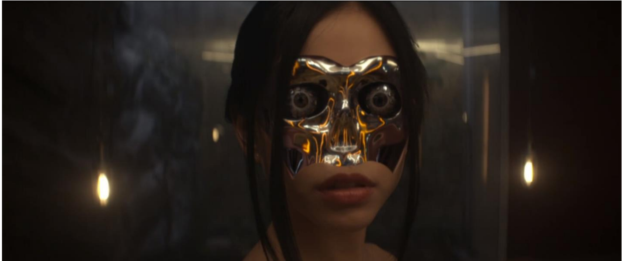
Figure 1. the revealing of Kyoko

its real fleshliness, Caleb then eagerly inspects his face, feels inside his mouth, before finally producing a razor to cut open his wrist. Prying open the wound and apparently satisfied with the copious amount of blood now dripping onto the floor, he smashes his fist against the blood-stained mirror in front of him, seemingly having resolved his anxieties. There is perhaps no example that better demonstrates the idea of ornamental objects mirroring the inherent objecthood of the human, ultimately enticing one to confront their own ontological condition as other than the organic, natural being they believe themselves to be. Thus, while Kyoko is at once highly racialized and gendered, she is also an embodiment of the abstract crisis of modern personhood outlined by Ornamentalism, prompting a reimagining of subjectivity through her cyborg body.