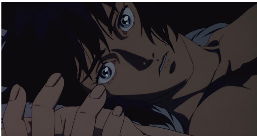
Figure 4. Kusanagi Motoko

“ghostless” beings hacked by the Puppet Master are dispensable, interchangeable pieces scattered along the way in Kusanagi’s pursuit of the American mastermind, conveniently contrasting the Major’s own capacities of intellectual and moral reflection. At the same time, white characters such as the American A.I. specialist Dr. Willis are also portrayed more realistically in terms of phenotypic features (figures 4-6). The seemingly innocuous flatness of characters in animation thus does not absolve its creators of the racial markers that typically come with embodiment; in fact, ideologies of racial and national identity are in a sense more explicitly visualized in such animated texts, as they demonstrate directly how racial identities are quite literally imagined, created, and circulated through hand-drawn celluloid sheets. In this instance, the film reproduces the logic of techno-Orientalism by visually projecting the dehumanizing western signifiers of “primitive” Asianness onto the Chinese, reinforcing the yellow peril-style visual rhetoric that links certain constructed racial features with backwardness, threat, and intellectual poverty. Just as the western gaze fortifies its own humanity in the face of the uncanny, robotic Asian stereotype, the Japanese makers of Ghost effectively contrast and elevate a superior Japanese identity that is intended to be viewed as more human than the Chinese, both morally and visually.