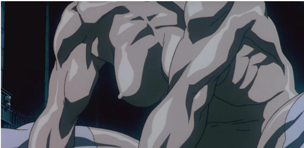
Figure 7. Kusanagi's hyper-real body