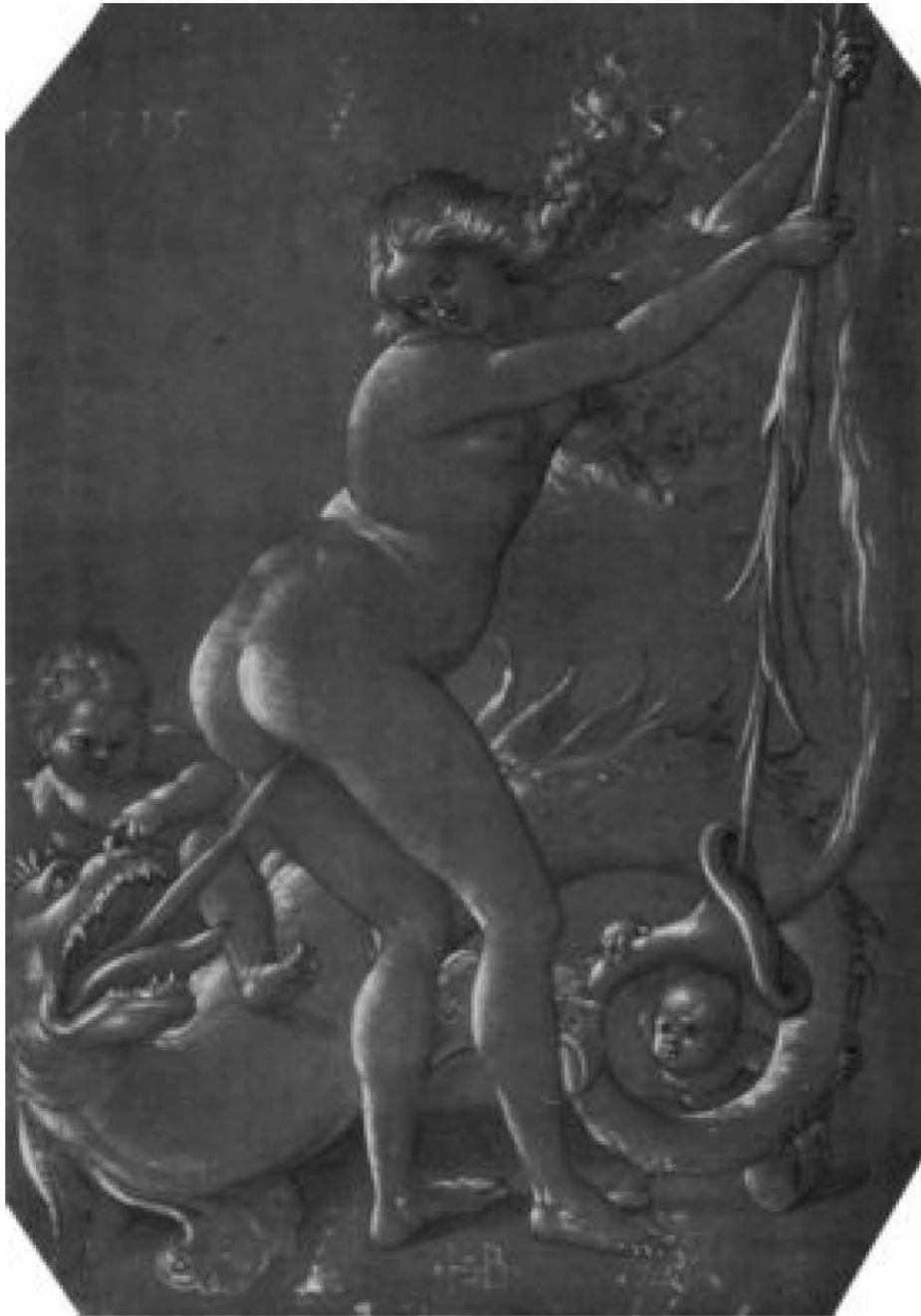
Fig. 8: Hans Baldung Grien, Witch and Dragon , 1515, Staatliche Kunsthalle, Karlsruhe.