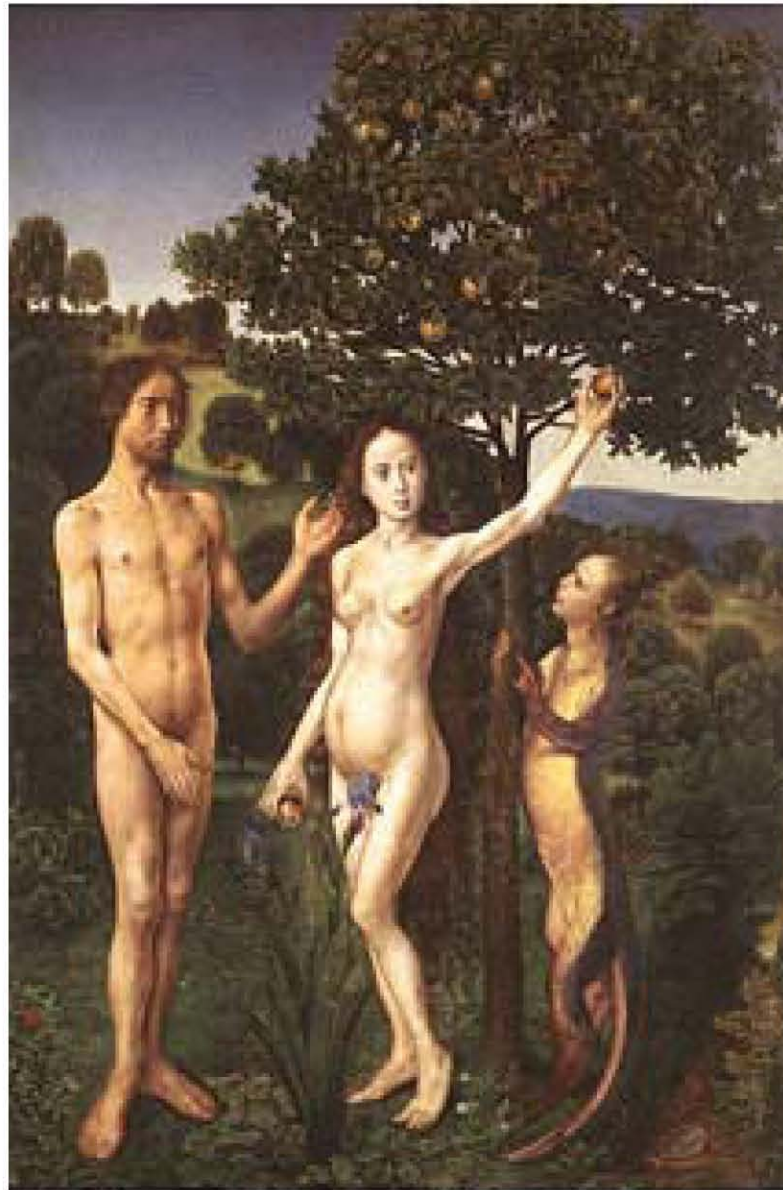
Fig. 10: Hugo van der Goes, The Fall of Man, Kunsthistorisches Museum, Vienna.