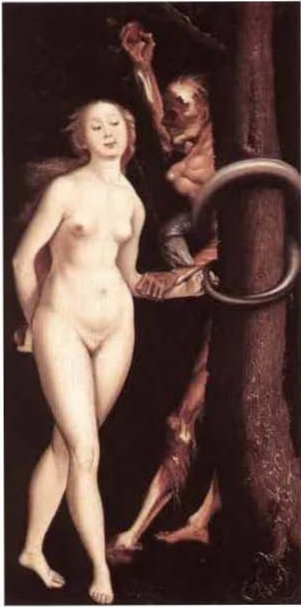
Fig. 6: Hans Baldung Grien, Eve, the Serpent, and Death, 1510-1512, The National Gallery of Canada, Ottawa