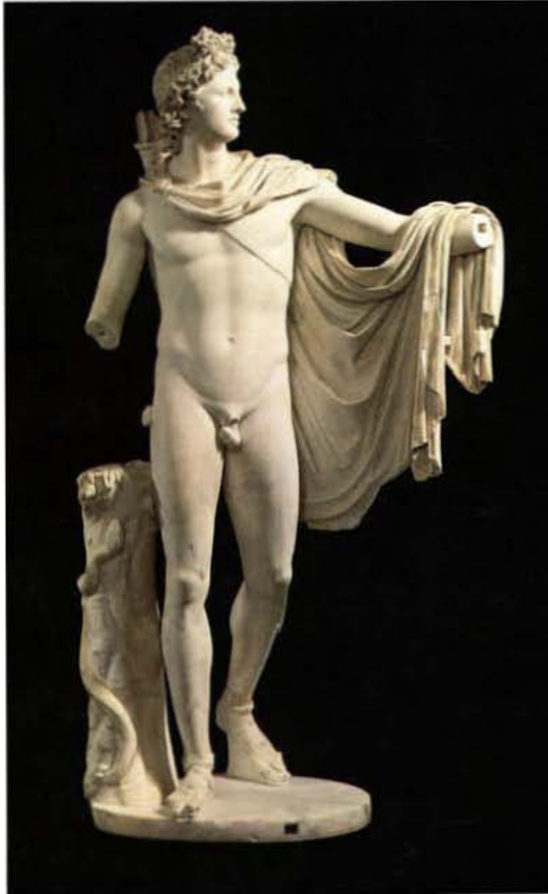
Fig. 3: Apollo Belvedere, 5 th century BCE, Pio Clementino Wing, Musei Vaticani, Vatican City, Rome.