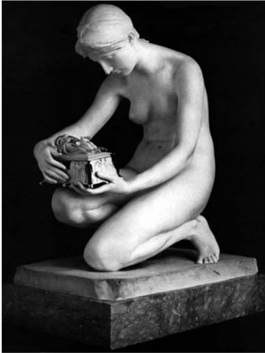
Fig 1: Henry Bates, Pandora, 1891, Tate Britain.