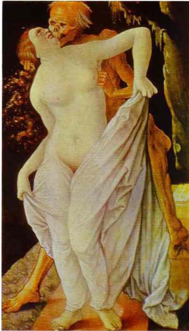
Fig. 7: Hans Baldung Grien, Death and the Woman , 1518-20, Öffentliche Kunstsammlung Kunstmuseum, Basel.