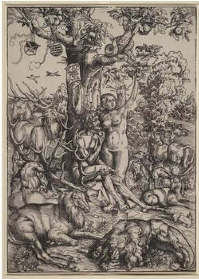
Fig. 9: Lucas Cranach the Elder, Fall into Sin , 1509.