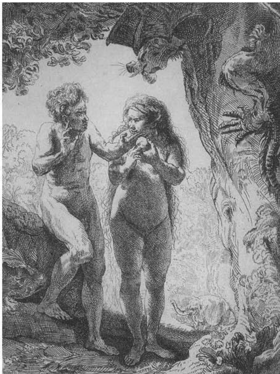
Fig. 11: Rembrandt, The Fall of Man, 1638, British Museum, London.