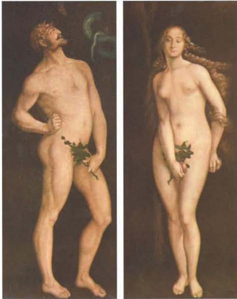
Fig. 4: Hans Baldung Grien, Adam and Eve – Fall of Man, 1525, Museum of Fine Arts, Szepmüvészeti Museum, Budapest.