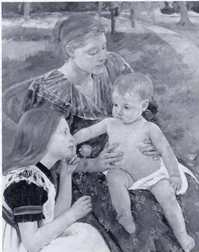
The Family . Oil on canvas by Mary Cassatt, 1892.