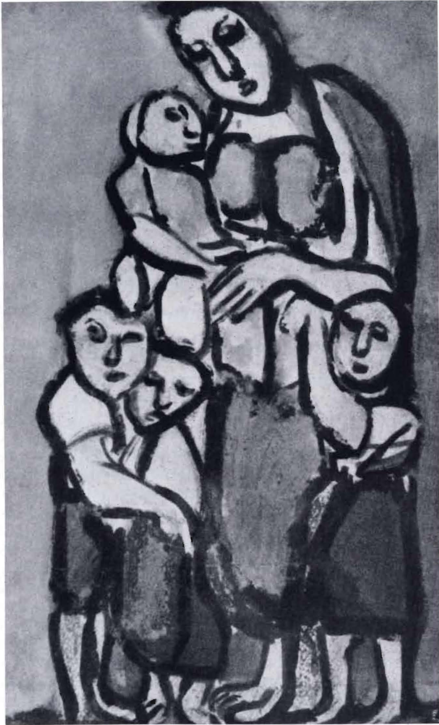
The Fauborg of Toil and Suffering. Tempera painting by Georges Rouault, 1912.