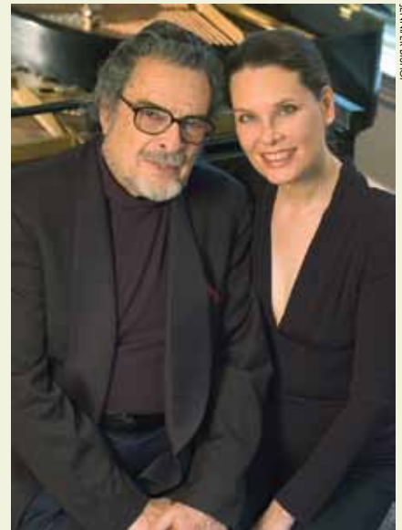
The Fleisher Duo