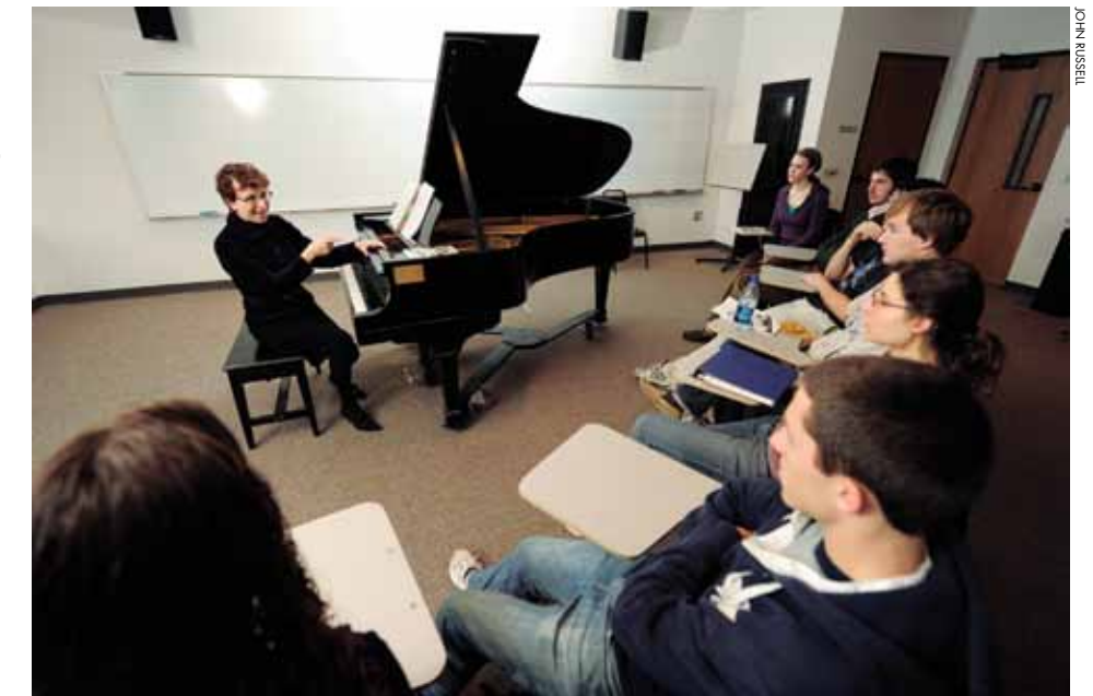
When teaching upper level musicianship courses, Ploger stresses the similarities between learning sound factors in music and learning language skills.