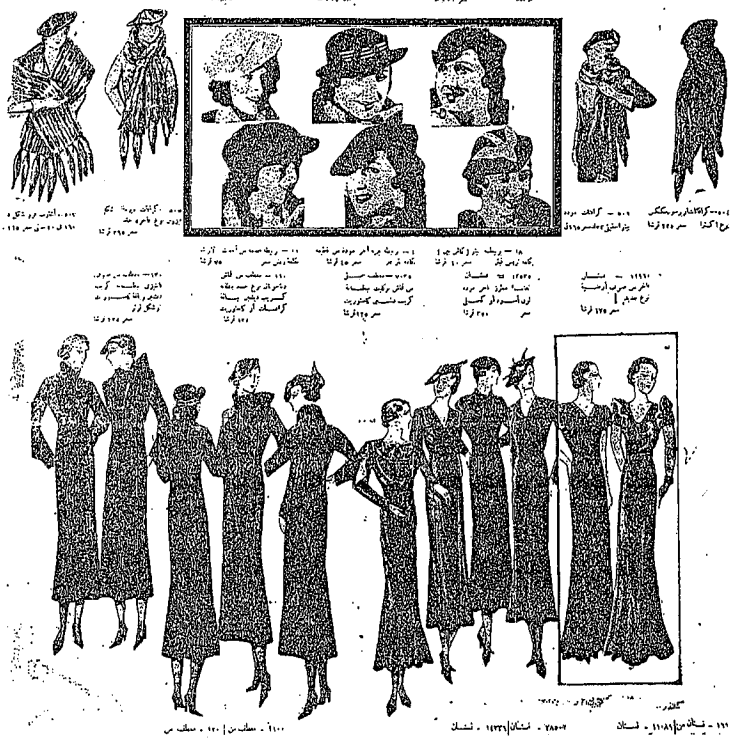
Figure 2 267