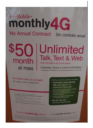
Figure 1 T-Mobile Advertisement

During our visit to the immigrant community near Nolensville Pike, we came across a lot of posters and handouts written solely in Spanish or in both Spanish and English (see Figure 1 for example). Inspired by what I have seen, I suggest to ELL teachers that students work cooperatively to translate the monolingual texts on posters or handouts into English and redesign the patterns of the original materials for the inclusion of English texts. This group activity can not only develop students' translating and writing skills, but also stimulate their creativity and interest. Jimenez et al (2009) point out that translation tasks require the negotiation of the linguistic and pragmatic choices essential for producing the most accurate translation. Therefore, my next suggestion for designing translation tasks would be that teachers group native English speakers and ELL students together and ask them to mutually evaluate the translation work and give some useful advice for correction to one another.