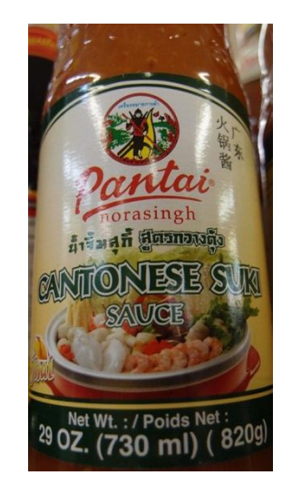
Figure 2 Cantonese Suki Sauce