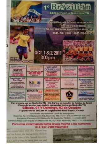
Figure 3 Soccer Fest Notice

Setting up discussions among students from a variety of backgrounds opens up opportunities for