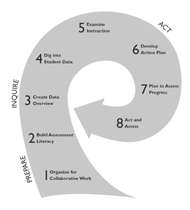
Figure 3. Data Wise Cycle

Evaluation of formative assessment practices should be an ongoing process in which teachers are constantly monitoring the needs of the students and the tools utilized to uncover evidence of student learning. As the teachers engage in a book study, the administrators should utilize a "big picture" framework for formative assessment. An additional resource that will help frame a cycle of continuous improvement around assessment and its impact on instruction and achievement is Data Wise by Boudett, City, and Murnane (2010). This text presents a process through which teachers and administrators can increase their data and assessment literacy, with concrete examples from two case study schools. This cycle includes stages to prepare, inquire, and act and is designed to facilitate ongoing reflection in which teachers are constantly evaluating their practices and their effect on student learning. The processes outlined in this text should frame all other recommendations and provide a context for change.