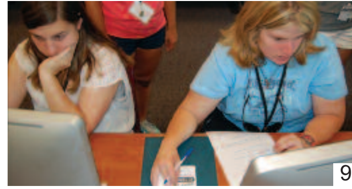
"I liked learning about mindfulness."