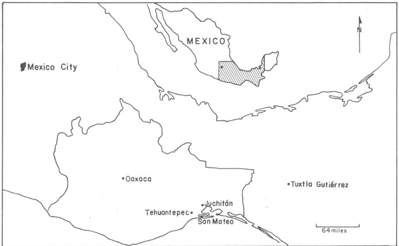
MAP 1: SOUTHERN MEXICO

processes through which it is currently being transformed, a brief regional historical background will first be presented to lend perspective to the ensuing description of the San Mateo of today.