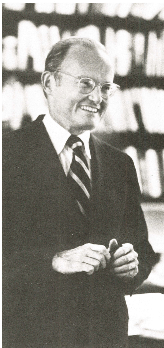
McGeorge Bundy, Professor of History at New York University, will speak to the Friends of the Library Annual Dinner Meeting, November 19.

The Dinner Meeting will be held at the University Club of Nashville, with a reception beginning at 6:30 p.m., followed by dinner at 7:30. A brief business meeting will feature the president's report, as well as reports by several of the committees of the Friends. Dinner will cost $25 per person and attendees must be members of the Friends. This issue of Chronicle provides a current list of membership. Invitations to members of the Friends have already been mailed. Those interested in joining the Friends or in attending the Dinner meeting should call Library Administration at 322-7100.