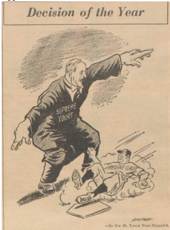
Figure 1: The Toolson decision called the reserve clause safe at home. The artist did not draw hands very well. "Decision of the Year," The St. Louis Post Dispatch , reprinted in The Sporting News , November 18, 1953 "Sporting News Clippings 1950-1953," Box 1, Emanuel Celler Papers, Library of Congress, Manuscript Division, Washington D. C.