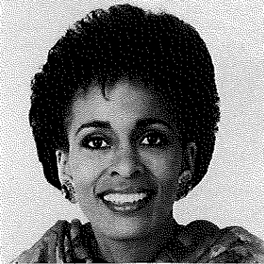
Faye Wattleton, President Planned Parenthood Federation of America

The AIDS-aware college student knows that a one night stand is like playing Russian Roulette, and that the bullet may not explode for months, sometimes