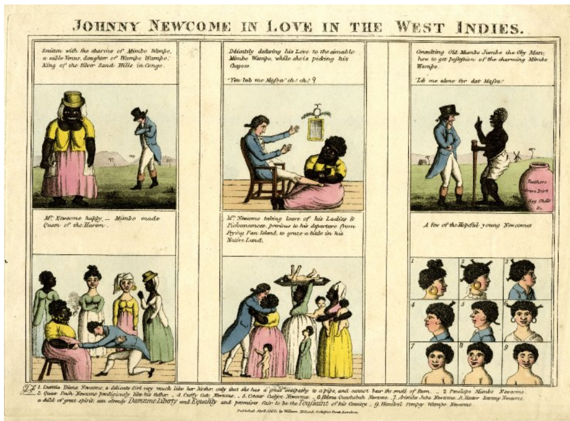
Fig. 2: Anonymous, Johnny Newcome in Love in the West Indies , 1808, London. British Museum.

to woo Mimbo Mampo. This reference to the practice of Obeah is in itself quite