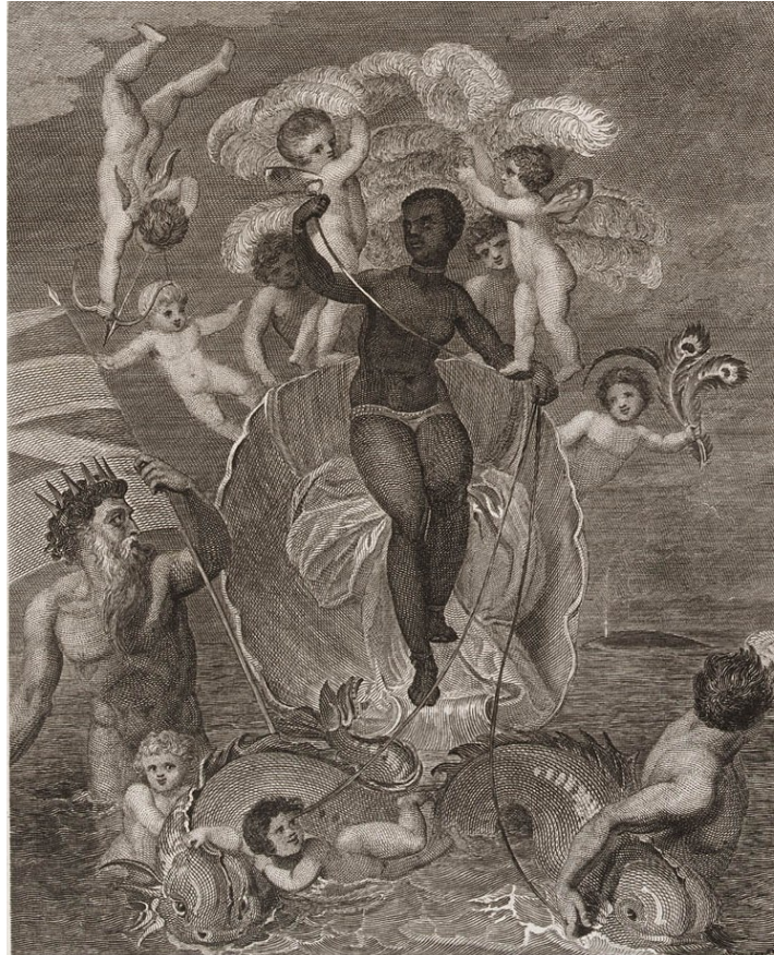
Fig. 1. Thomas Stothard, Voyage of the Sable Venus from Angola to the West Indies , 1794, London, Royal Greenwich Museum.

contrary (e.g. Leslie and Vernon’s 1740 publication). Depictions of black female beauty were by no means uncommon, even much later in the eighteenth century: Regulus Allen writes of the 1790s that the so-called, “Black Venus remain[ed] a sexually desirable